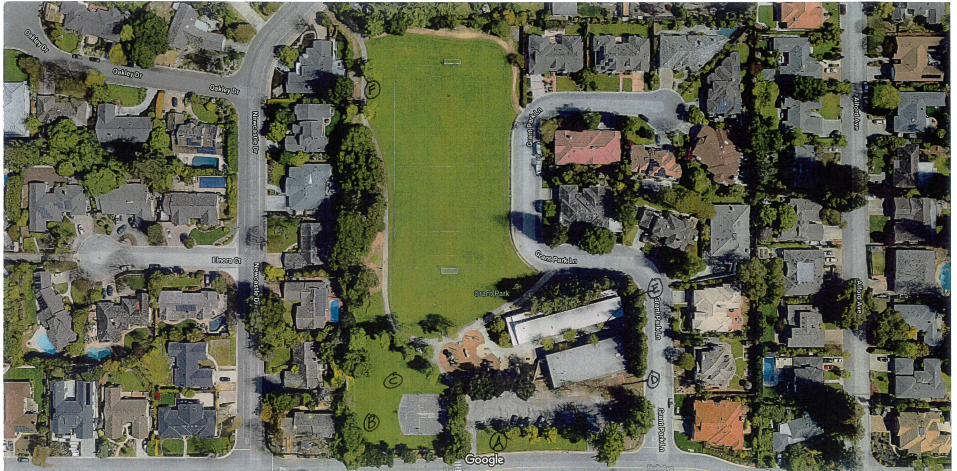
Imagery ©2019 Google, Imagery ©2019 CNES / Airbus, Maxar Technologies, U.S. Geological Survey, Map data ©2019 50 ft