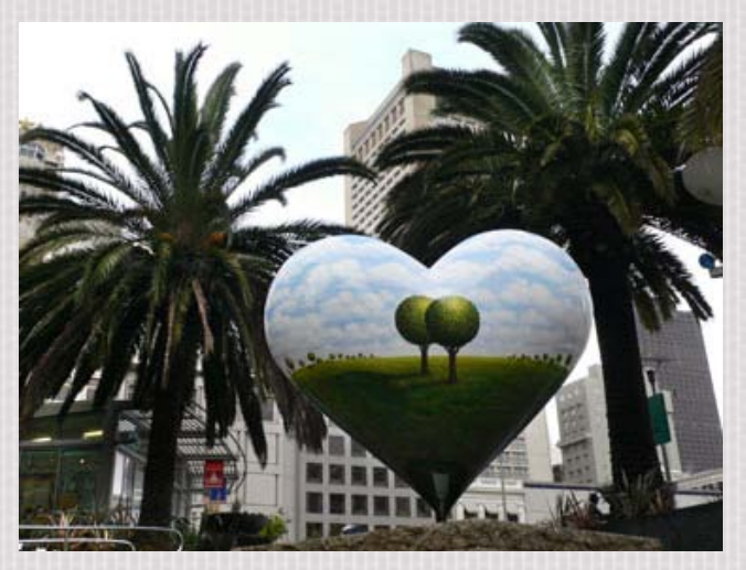
Hearts, San Francisco, CA