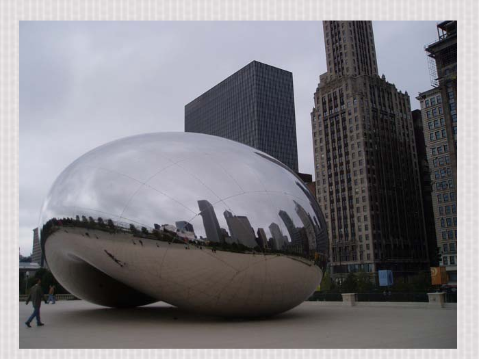
The Bean in Chicago, IL