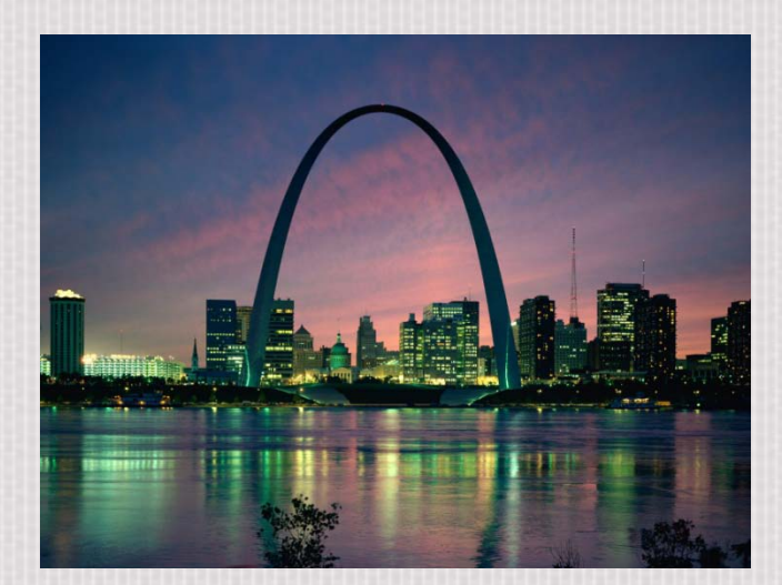
St. Louis Arch, St. Louis, MO