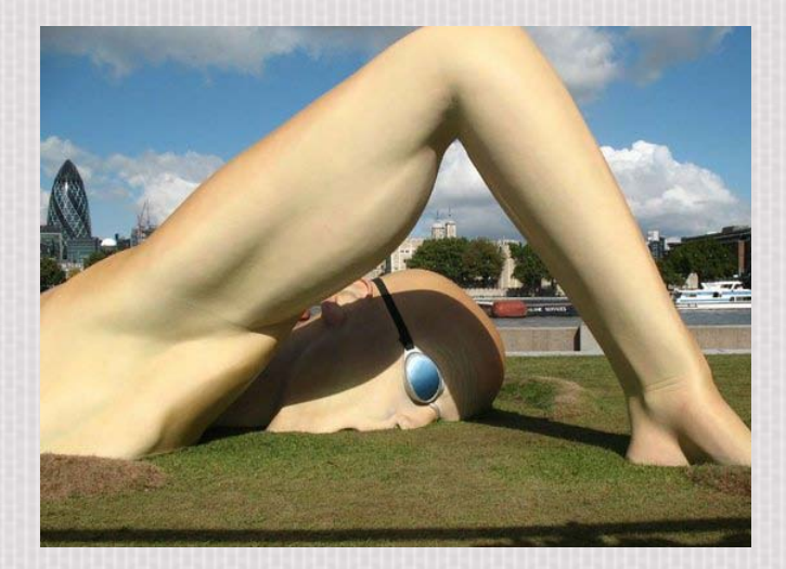
The Swimmer, London, England