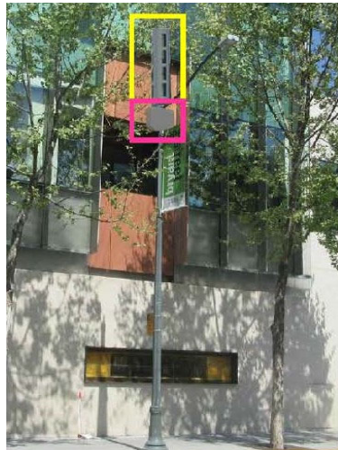
Figure 8: Stand-alone small cell poles (as shown in this example) are not preferred but may be permitted if enclosure of all equipment within the pole or in an underground vault is technically infeasible.

b. The maximum height of any antenna mounted to a street light pole shall not exceed seven feet above the existing height of a street light pole in a location where the closest adjacent district is a commercial zoning district and shall not exceed three feet above the existing height of a street light pole in any other zoning district. Any portion of the antenna or equipment mounted on such a pole shall be no less than 18 feet above any drivable road surface or 7 feet above any portion of the right-of-way outside of the drivable road surface (e.g., parkways, medians).