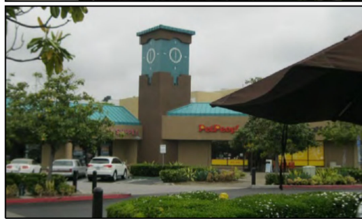
Figure 4: A cupola (above) and a clock tower (below) conceal antennas.