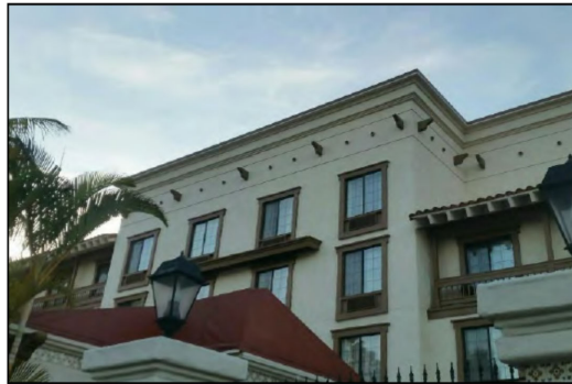
Figure 2: This completely concealed wireless telecommunications facility, including antennas, is cited in the City of San Diego's Land Development Manual in its guidelines for wireless communications facilities.

Antennas. Façade-concealed antennas have antennas, mounting apparatus, and any associated components fully concealed from all sides within a structure that achieves complete architectural integration with the existing building (for example, antennas behind fiber-reinforced plastic [FRP] in a parapet, and equipment inside an existing building), or within outbuildings that are architecturally integrated into a site and are expected components of the setting. This preferred installation type has the following additional characteristics.