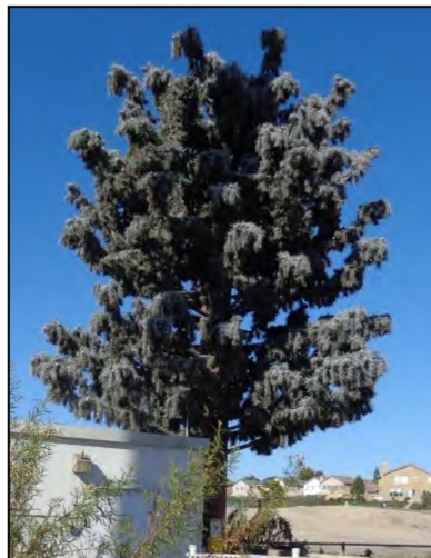
Figure 6: In this example, antennas are concealed by the faux "mono-pine."