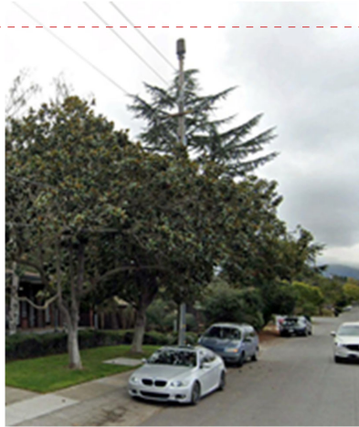
Figure 7: Landscaping conceals wireless telecommunications equipment mounted on the exterior of this pole located on Distel Drive.

Comment G-11: Verizon contends this section is inconsistent with PUC General Order 95 and needs revision. The revised text ensures consistency with General Order 95.