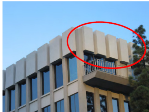
Figure 1: This well-concealed wireless telecommunications facility has its antennas architecturally integrated into the building.

b. Non-integrated (unconcealed) installations are less preferred and permitted only where an integrated (concealed) facility is either infeasible or would reduce the number and overall visual intrusiveness of wireless telecommunications facilities required to provide service within the City.