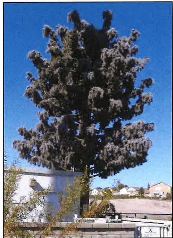
Figure 6: In this example, antennas are concealed by the faux "mono-pine."