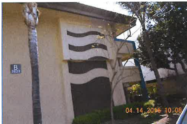
Figure 5: Although façade-mounted boxes are not preferred, this example from San Diego achieves integration with the structure.