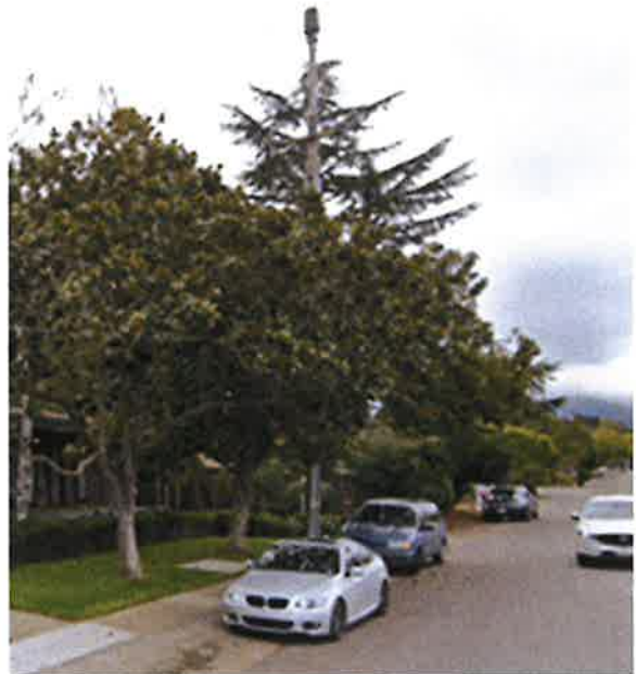
Figure 7: Landscaping conceals wireless telecommunications equipment mounted on the exterior of this pole located on Distel Drive.