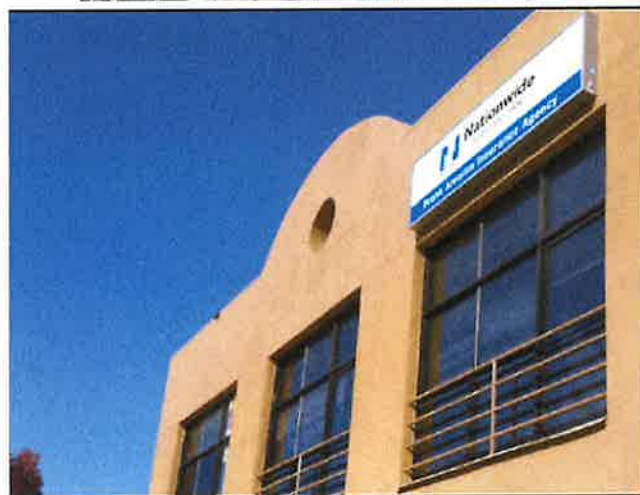
Figure 2: Antennas are concealed behind the circular element.