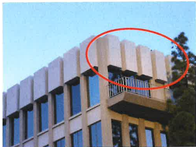
Figure 1: This well-concealed wireless telecommunications facility has its antennas architecturally integrated into the building.

c. Complete concealment (e.g., no visible exterior equipment) is preferred over other methods.