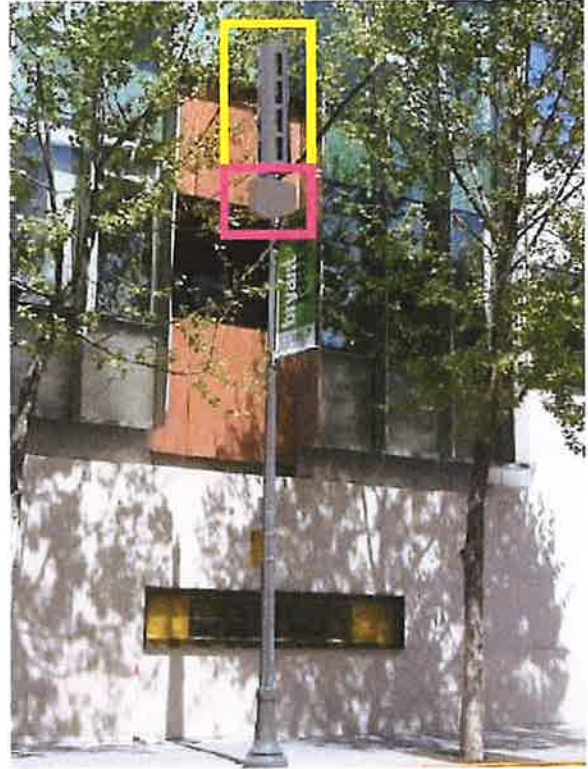
Figure 8: Stand-alone small cell poles (as shown in this example) are not preferred but may be permitted if enclosure of all equipment within the pole or in an underground vault is technically infeasible.