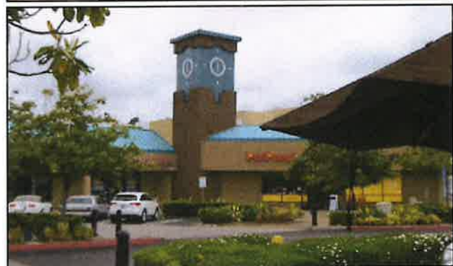
Figure 4: A cupola (above) and a clock tower (below) conceal antennas.