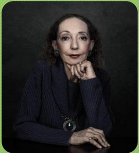
Joyce Carol Oates Saturday, May 8 3:00pm