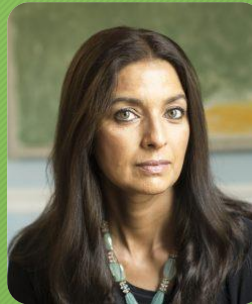
Jhumpa Lahiri Saturday, May 22 3:00pm