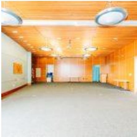
Morgan Hill (30.5k ft 2 )