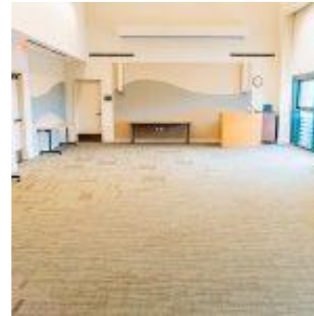
Gilroy (53k ft 2 )