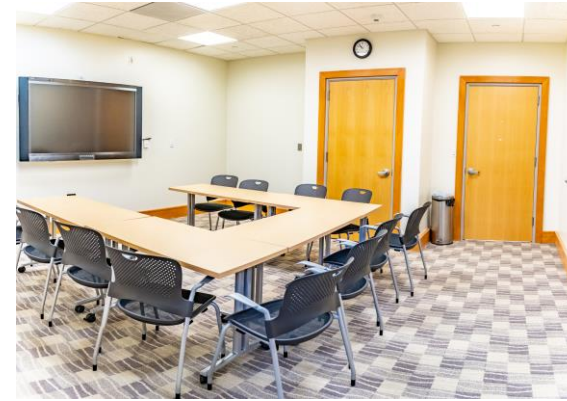
Saratoga (48.5k ft 2 )