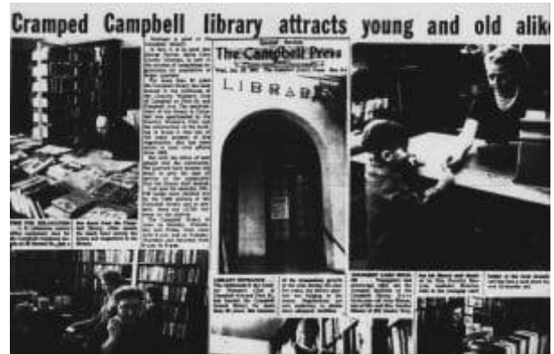
Campbell Press Article from January 25, 1961

There is also an extensive collection of more recent local newspaper articles from DigitalReelL that can be accessed from the library.