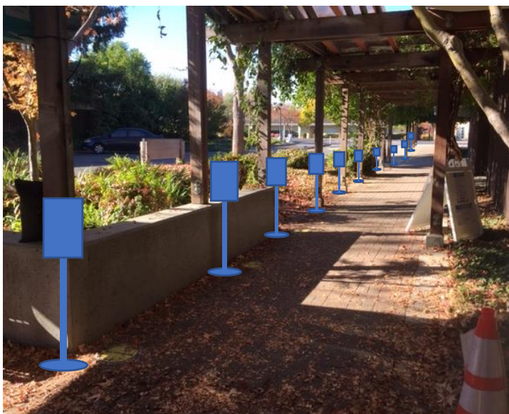
Signage placed along Waiting Line in front of Library

In the Los Altos library, there are 18 spots in the waiting line. The librarian could consider cycling through the signs at two week intervals to allow each resource more attention as the signs near the front will receive more traffic.