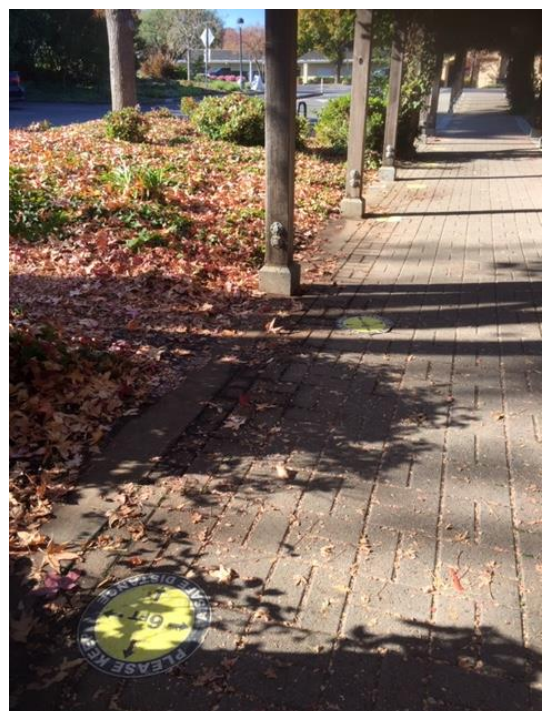
Signage to be placed next to Social Distancing Decal