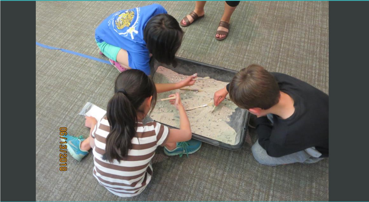
Children joined us for a fun hands on, interactive program all about dinosaurs.