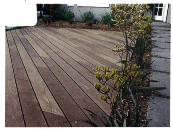
Deck, Platform, Wood Stairs, Fence and Gate Tournesol Boulevard Deck Boards