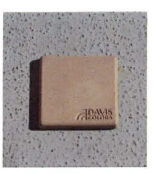
Concrete Sierra Davis Color