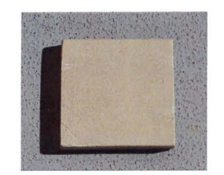
Autocourt and Patio SBI Indiana Limestone