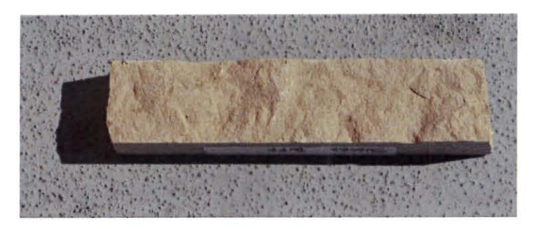
Freestanding wall and Seatwall SBI Sussex Buff