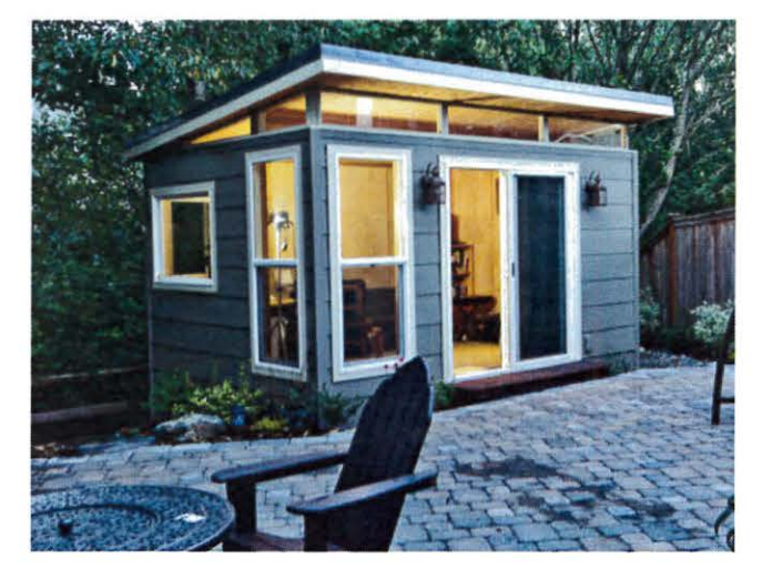
Shed Modern Shed