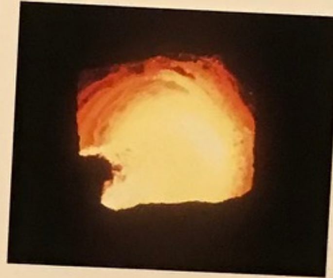
ABOVE: Interior view of the kiln. The temperature and feed process are operated from the control room.