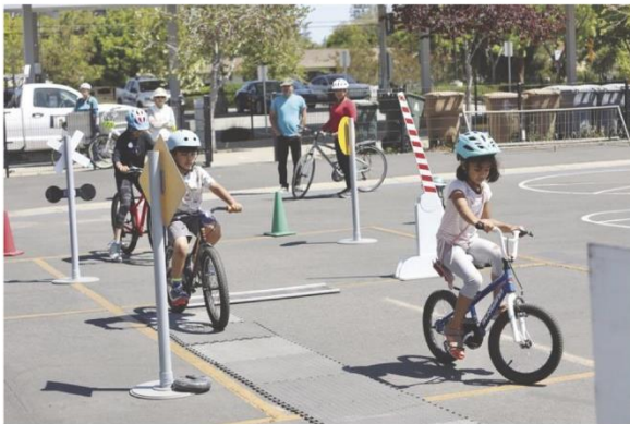
Students navigate a bike course at the 2022 Los Altos Police Department-sponsored Bike Rodeo at Loyola School.

May is National Bike Month, and to kick off the festivities, the Los Altos Safe Routes to School program encouraged all local schools to plan a Bike to School Day event. Throughout the month, thousands of students across the city and country will bike and