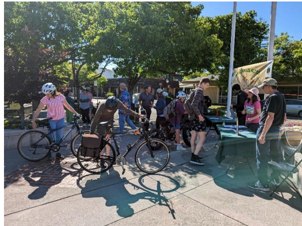
Left: GreenTown members providing Bike Valet services. Right: Participants arriving at the event hub.