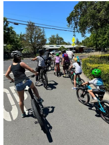
Above and Right: North Group Bike Ride, morning and afternoon.