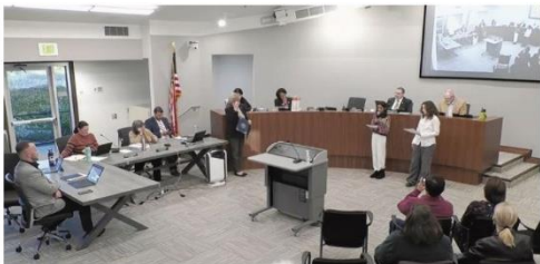
Screenshot from last week's Los Altos City Council meeting Students from Montclair Elementary and Egan Junior High schools read a mayoral proclamation recognizing National Bike Month during last week's Los Altos City Council meeting.

The City of Los Altos recognized for the first time May as Bike Month. Two Los Altos students read the proclamation during the City Council meeting on April 25 th .