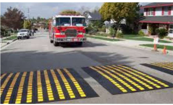
Speed Lump Configuration