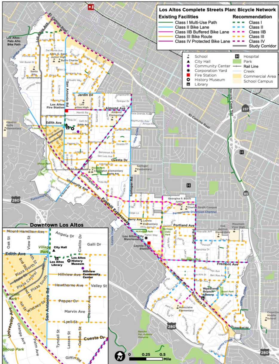
Figure 2. Proposed Los Altos Bicycle Network Map highlighting existing and proposed facilities.