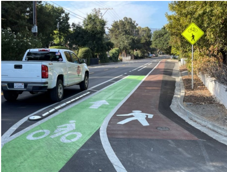
Figure 1. Complete Streets Project Sample in Los Altos guided through the CSMP Vision. El Monte Avenue from Almond Avenue to Clark Avenue. Bicycle & Pedestrian zones buffered from adjacent vehicle traffic by low profile curbs.

The Complete Streets Master Plan merges and updates both the bicycle and pedestrian transportation plans to ensure that recommended networks and projects are in line with one another and to recommend projects that consider both travel modes.