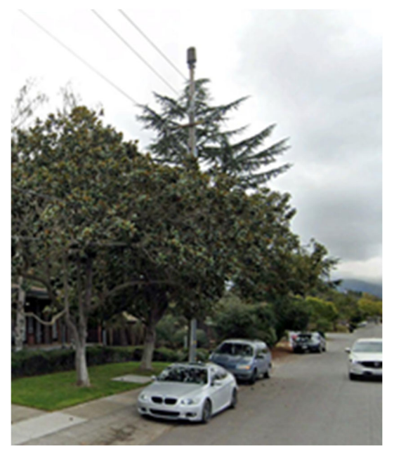
Figure7: Landscaping conceals wireless telecommunications equipment mounted on the exterior of this pole located on Distel Drive.

The shroud should be no more than 4 feet tall, including antenna, radio head, mounting bracket, and all other hardware necessary for a complete installation.