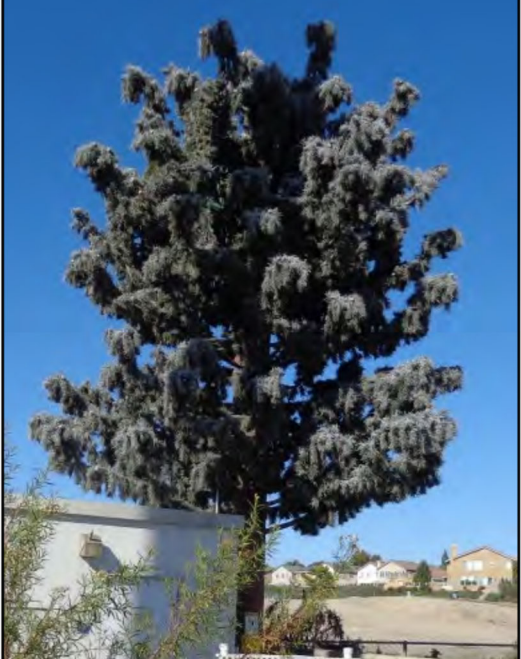
Figure 6: In this example, antennas are concealed by the faux "mono-pine."