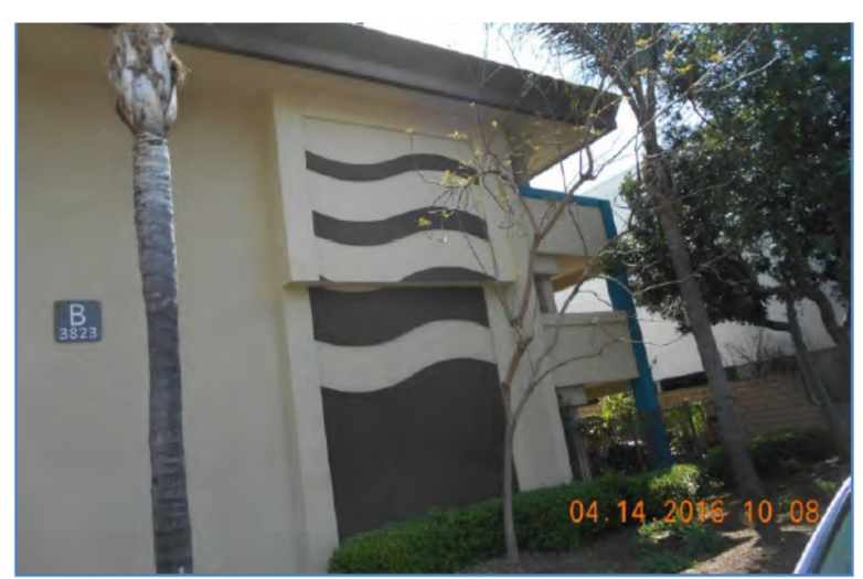
Figure 5: Although façade-mounted boxes are not preferred, this example from San Diego achieves integration with the structure.