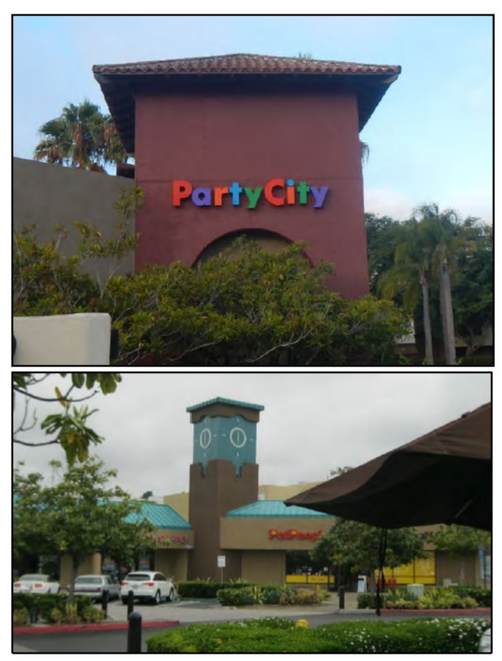
Figure 4: A cupola (above) and a clock tower (below) conceal antennas.