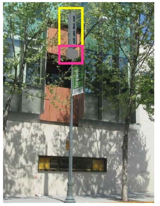
Figure 8: Stand-alone small cell poles (as shown in this example) are not preferred but may be permitted if enclosure of all equipment within the pole or in an underground vault is technically infeasible.

c. Stand-alone poles match the height and color of any nearby streetlight or utility pole.