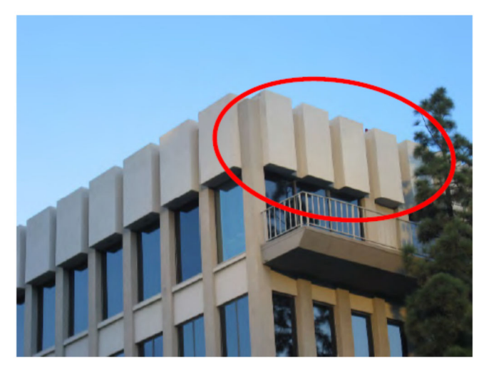
Figure 1: This well-concealed wireless telecommunications facility has its antennas architecturally integrated into the building.

intrusiveness of wireless telecommunications facilities required to provide service within the City.