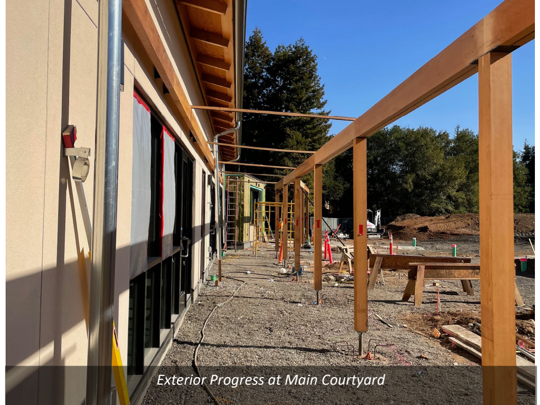
Exterior Progress at Main Courtyard