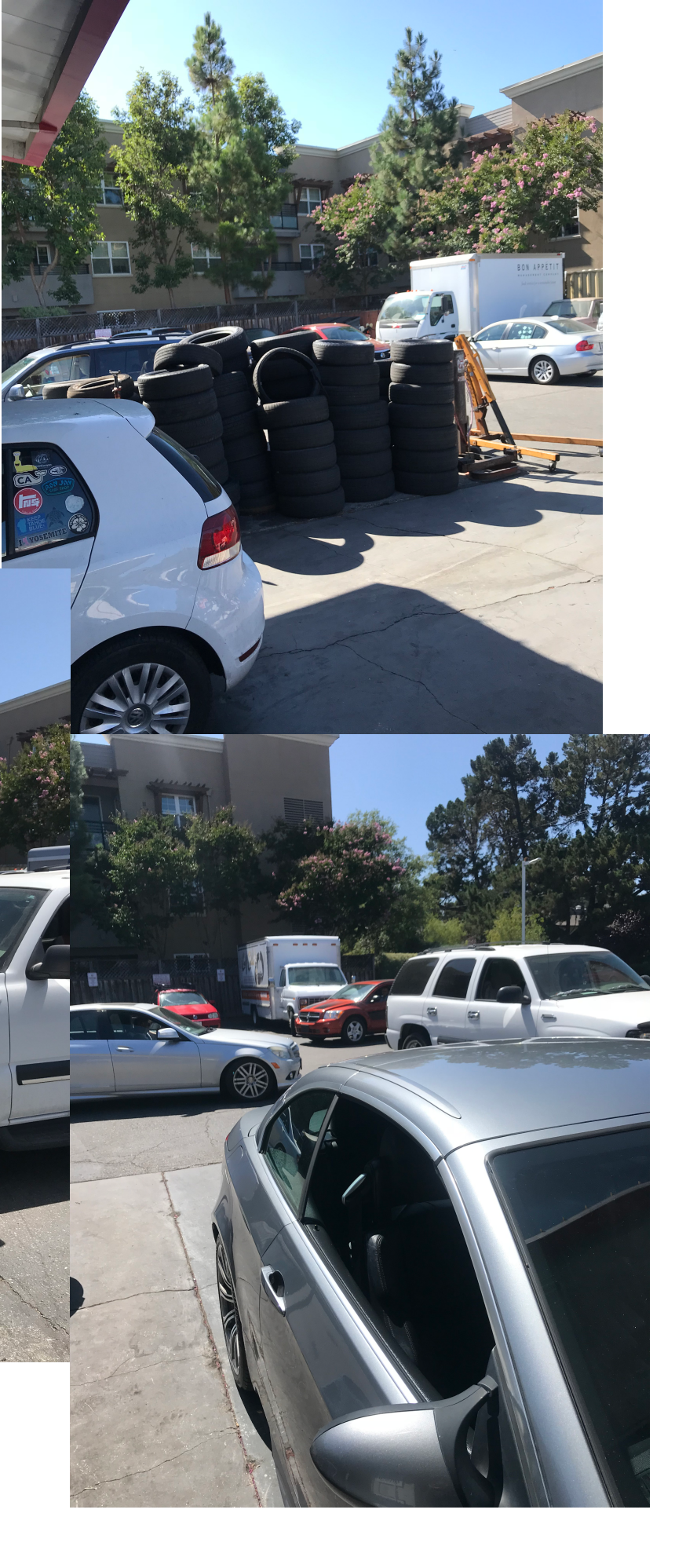
Figure 5 (bottom, right). Service area vehicle circulation.