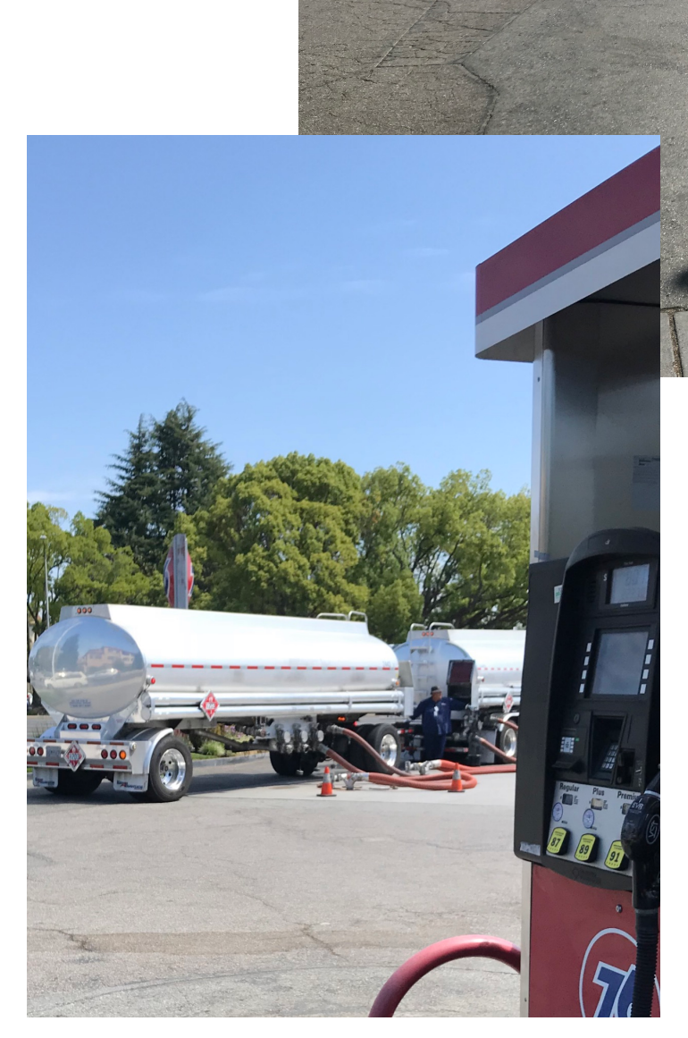
Figure 1 (top). Fuel tanker truck loading area near corner. Needs access from Los Altos Avenue and El Camino Real and open area surrounding it.

Figure 2 (left). Second type of fuel tanker.