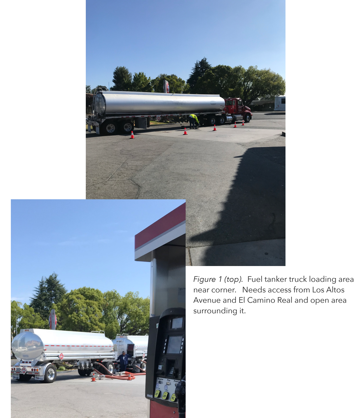
Figure 2 (left). Second type of fuel tanker.