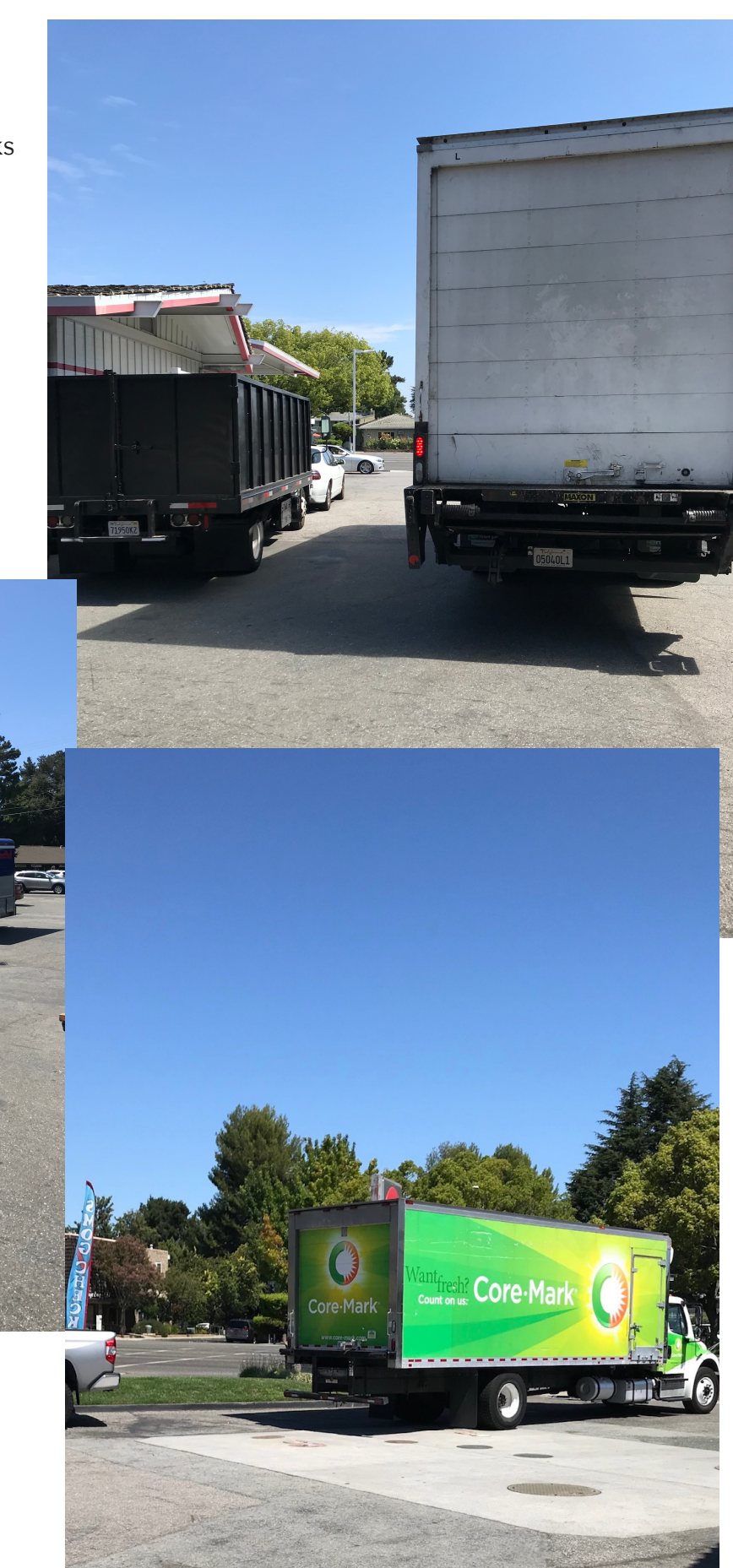
Figure 11 (bottom, right). Service truck at corner parking and loading area.

Figure 10 (middle, left). Service trucks in parking area off Los Altos Avenue.