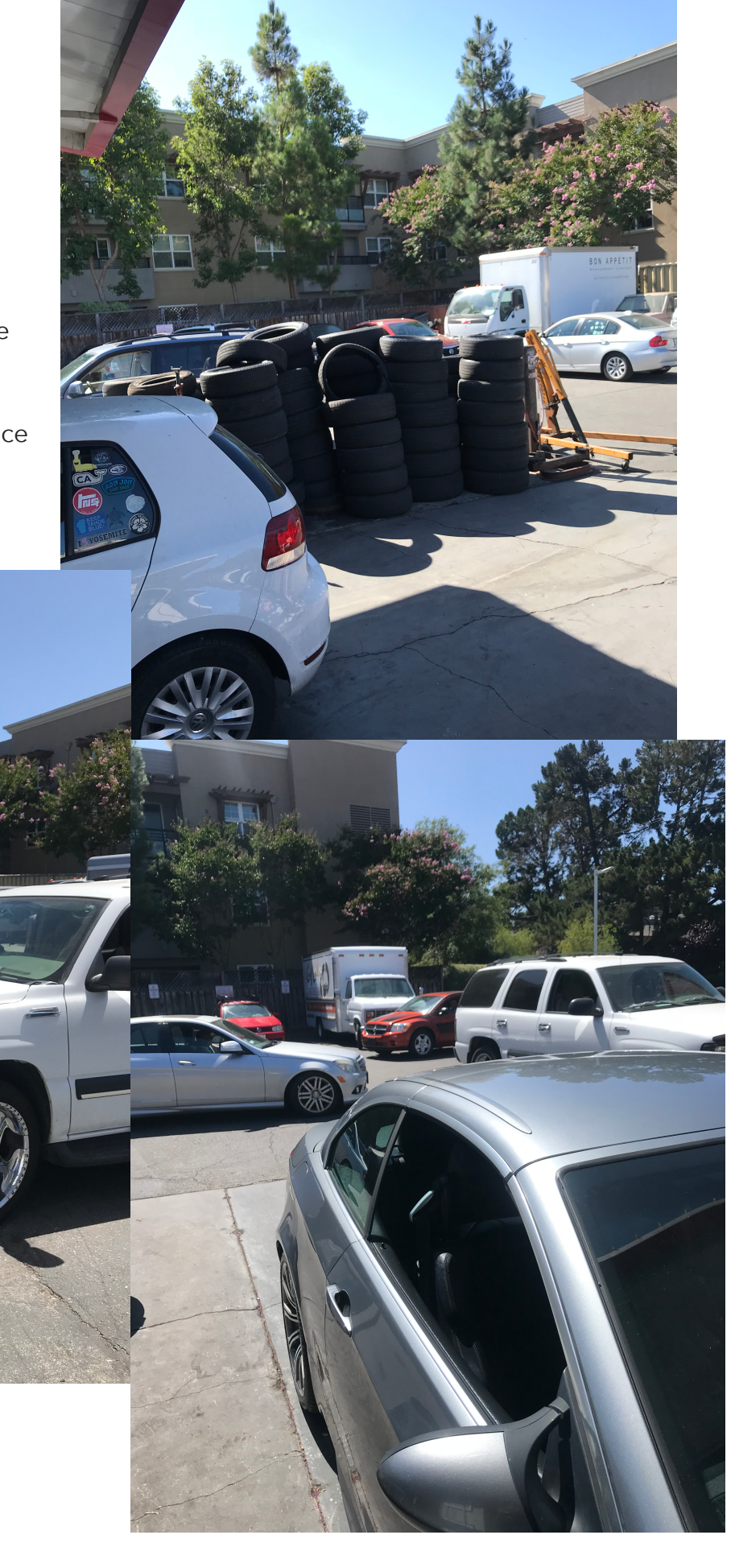
Figure 5 (bottom, right). Service area vehicle circulation.