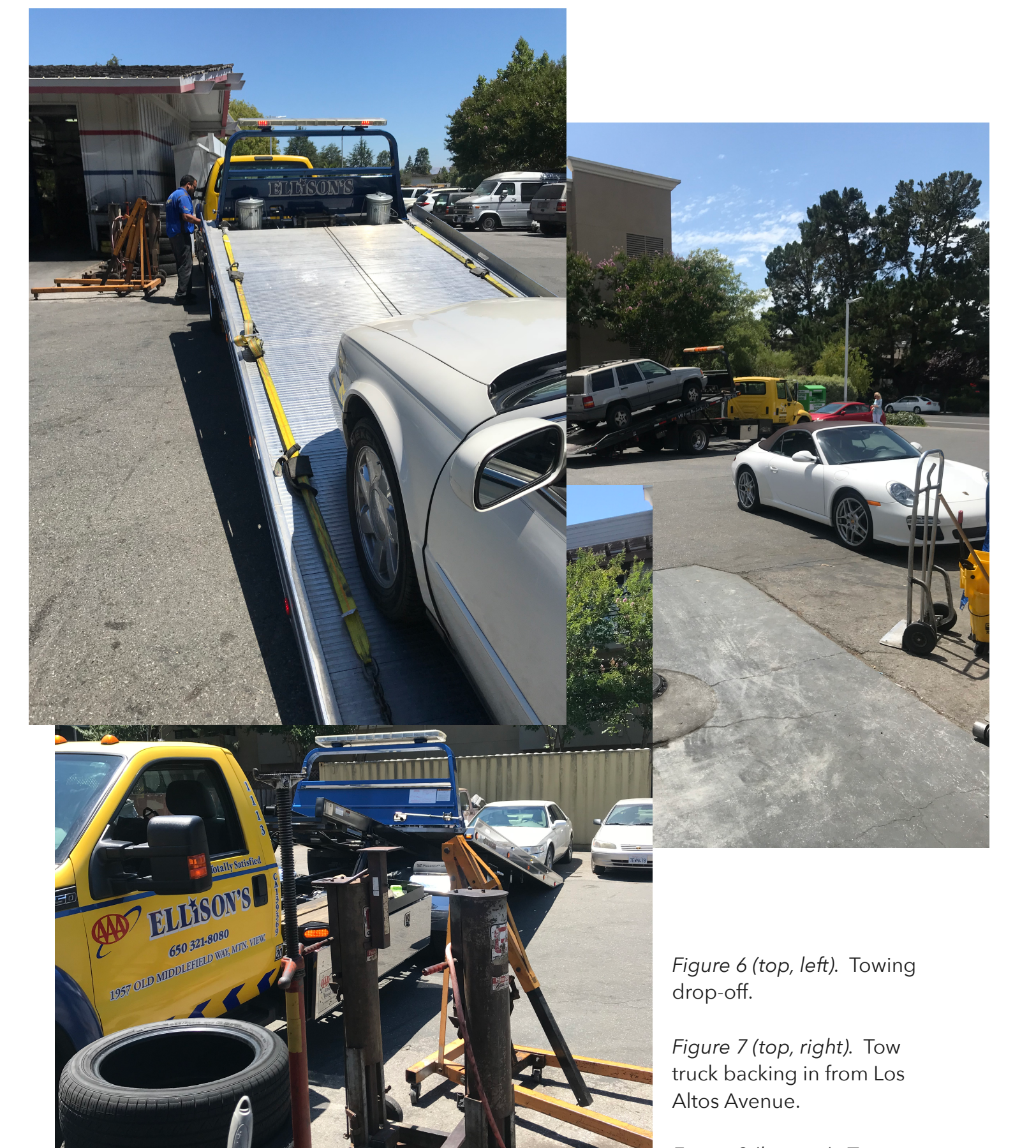
Figure 8 (bottom). Tow truck parking a vehicle for subsequent repair.