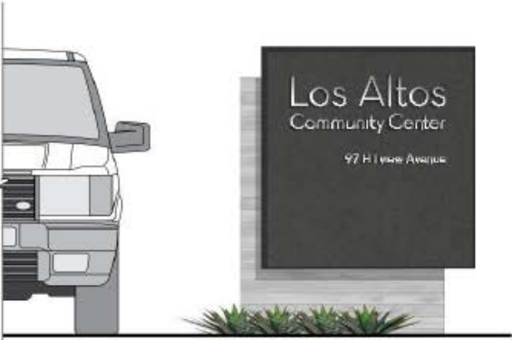
A: Board-formed concrete base with equitone panel