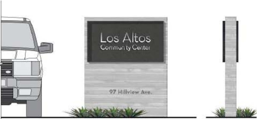
C: Board-formed concrete base with inset equitone panel