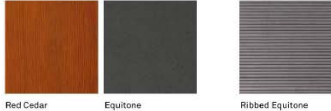
Red Cedar Equitone Ribbed Equitone