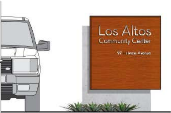
B: Smooth concrete base with red cedar panel