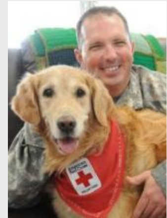
Service to the Armed Forces