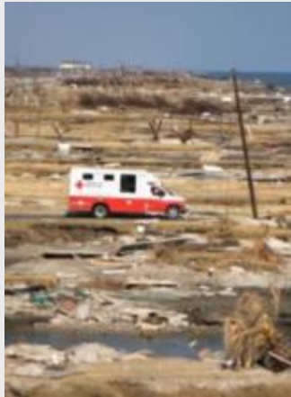
Disaster Cycle Services

Down the Street. Across the Country. Around the World.®