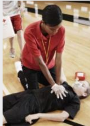
Preparedness, Health and Safety Services