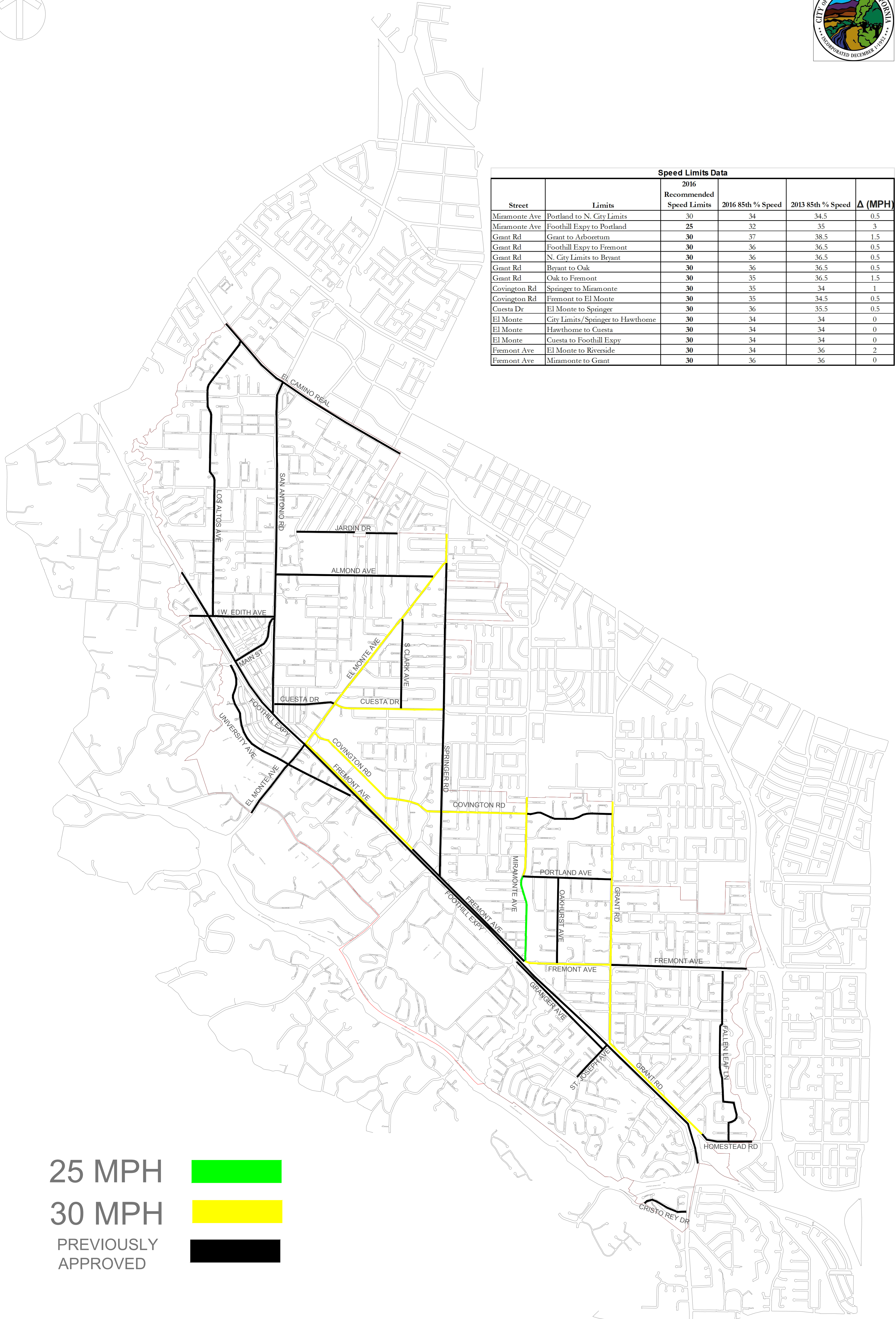
Speed Limits Data