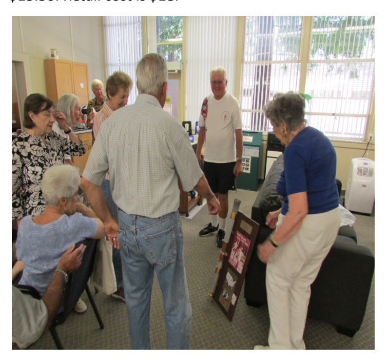
Grant Park Program activities are currently FREE to Members. Donations accepted!

See's Candies 1 lb. Gift Certificates are for sale for $15.50. Retail cost is $18.